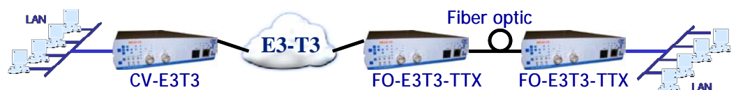
Ethernet interconnection over an E3 or T3 network

The CV-E3T3 transports an Ethernet traffic over an E3 or T3 link or network. The link is transparent to the Ethernet traffic and the upper protocols. Operation is very quick and easy. The peer end might be equipped with another CV-E3T3, but also with a couple of FO-E3T3 fibre optic modems if the E3/T3 network access point was far from the Ethernet network which would make some fault and / or cost increase with a coax cable.