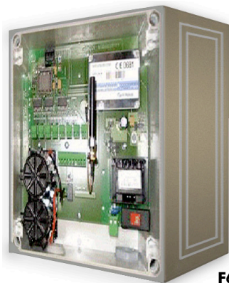
F62-GPS Messenger Inside View

Once triggered, the Messenger will dial the pre-programmed telephone number and enter a two-way exchange of data with the Host Terminal.